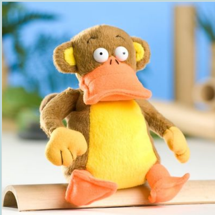
JUMBiES® - Darwin the Ducky