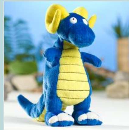
JUMBiES® - Warner the Tyramosaurus

Founded by two working moms, Capturing Couture is a unique collection of designer camera straps. The line includes a wide variety of designs, made with custom trims, quality hardware, velvet neckpads and strong nylon webbing. The straps define fashion and function for camera lovers. Various widths of full-length camera straps are offered, plus a selection of wristlet straps. Retail prices range from $19 to $35. The wristlet straps are multi-