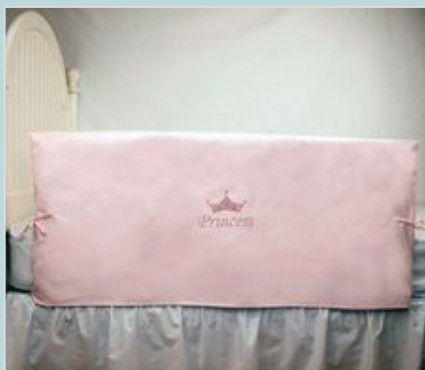
Kasey Kollection - Kover-Ups

At the 7 W NYC Baby & Kid Fair, I uncovered Kover-Ups , new decorative covers for children’s bed rails. Kover-Ups make bed rails more attractive and also shield children from germs.