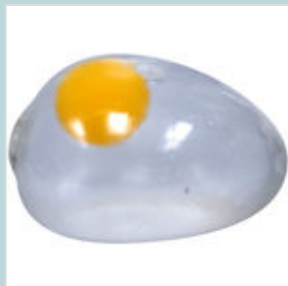
SplatBack! Collection - The Egg Splats and Goes Back!

Talk about a product “breaking all the rules!” I felt like a school boy again playing with a SplatBack toy at The California Gift Show. I had a blast as I slammed an egg-shaped ball to the ground and made it “crack” sunny-side up, then watched with amazement as it magically transformed back to its original shape. Crazy fun!