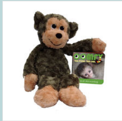
Oomfy™ - Thandi the Monkey